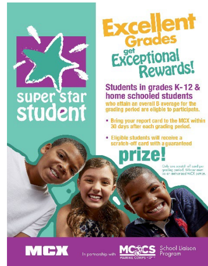
FLYER Size: 8.5" X 11"