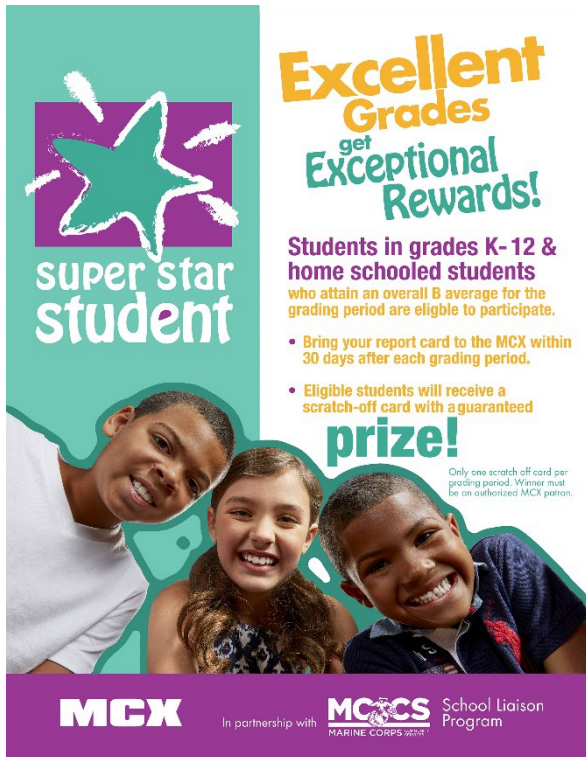
POSTER Size: 22" x 28"